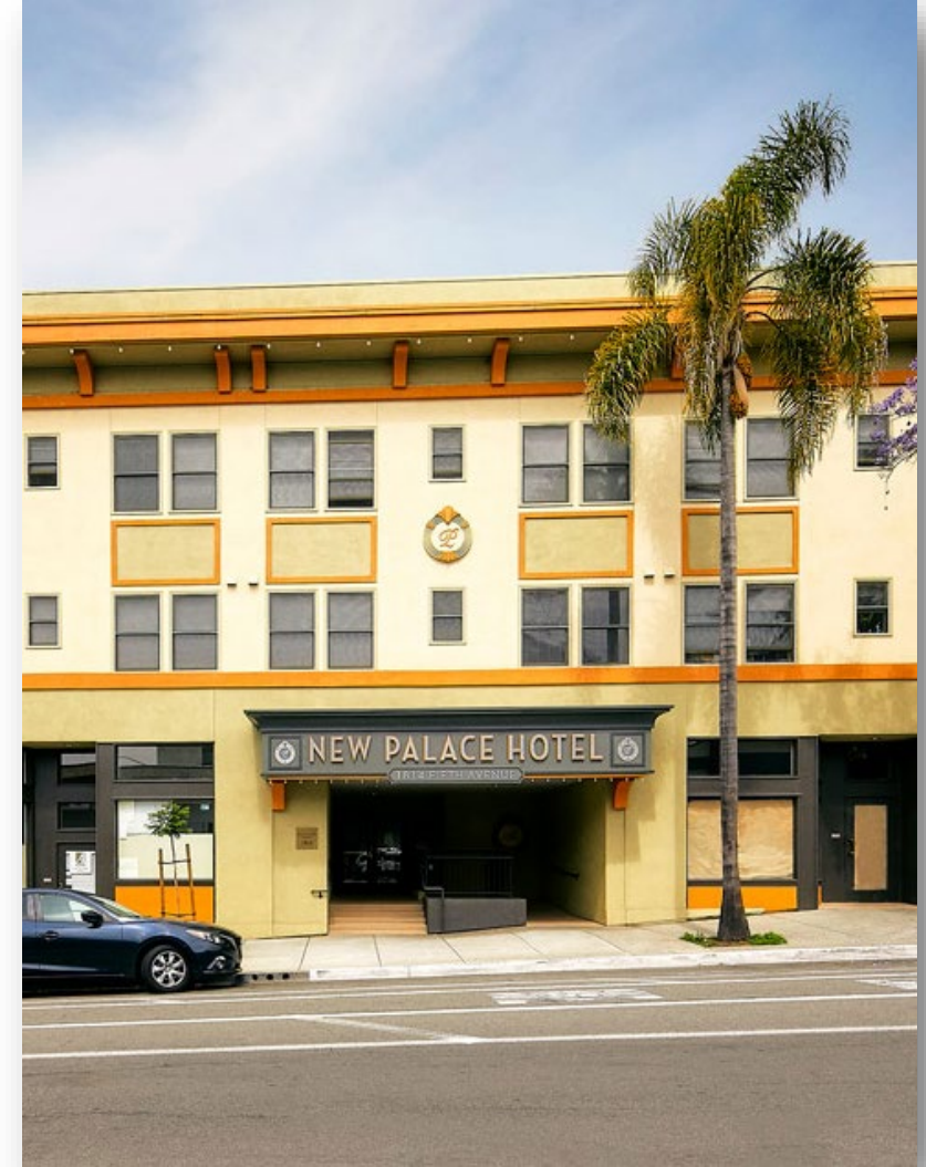
New Palace Hotel