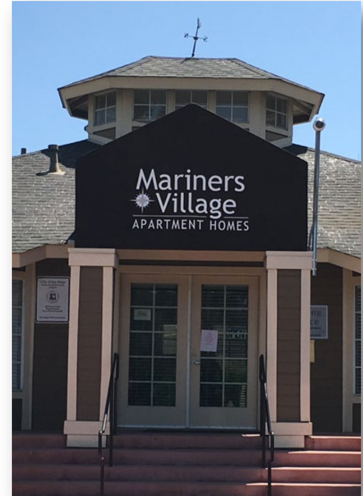
Mariners Village Apartment Homes