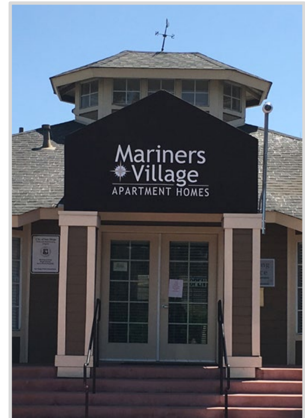
Mariners Village Apartment Homes