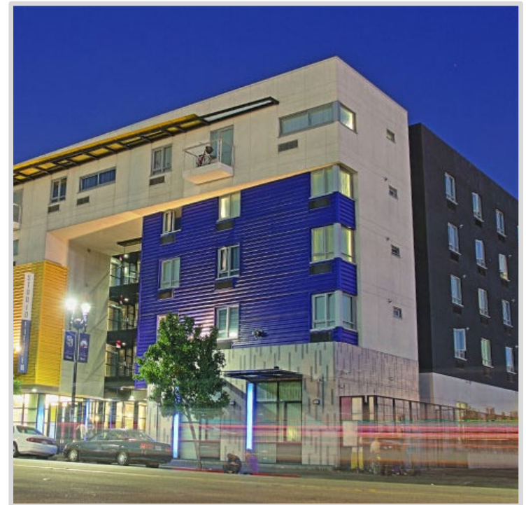
Studio 15 Apartments